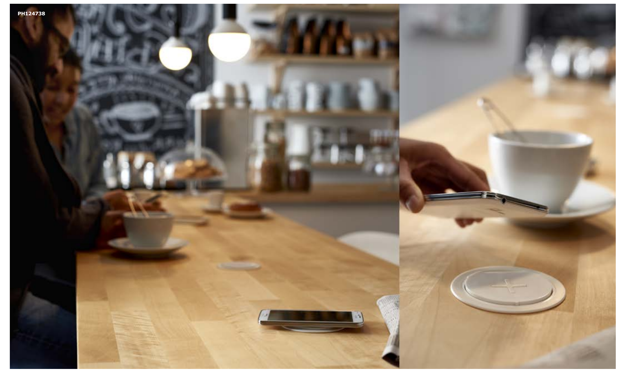
JYSSEN makes it easy for customers to charge their phones while charging on caffeine.