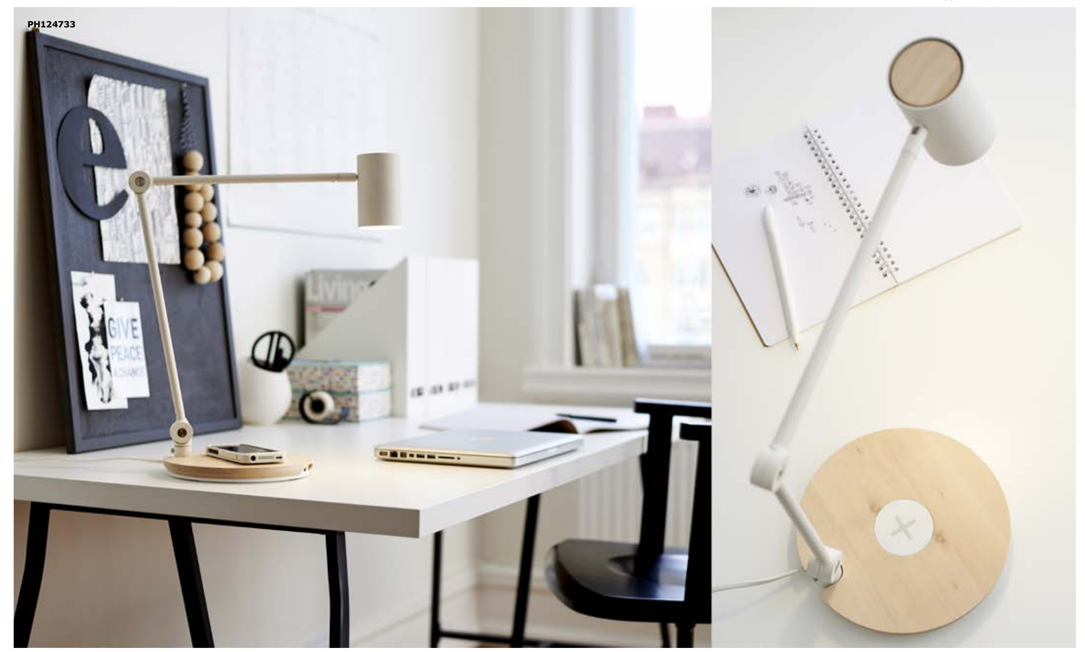
Good focused lighting, right where you need it. With RIGGAD work lamp, you get a lamp that charges your phone and helps keep your desktop free from messy cords.