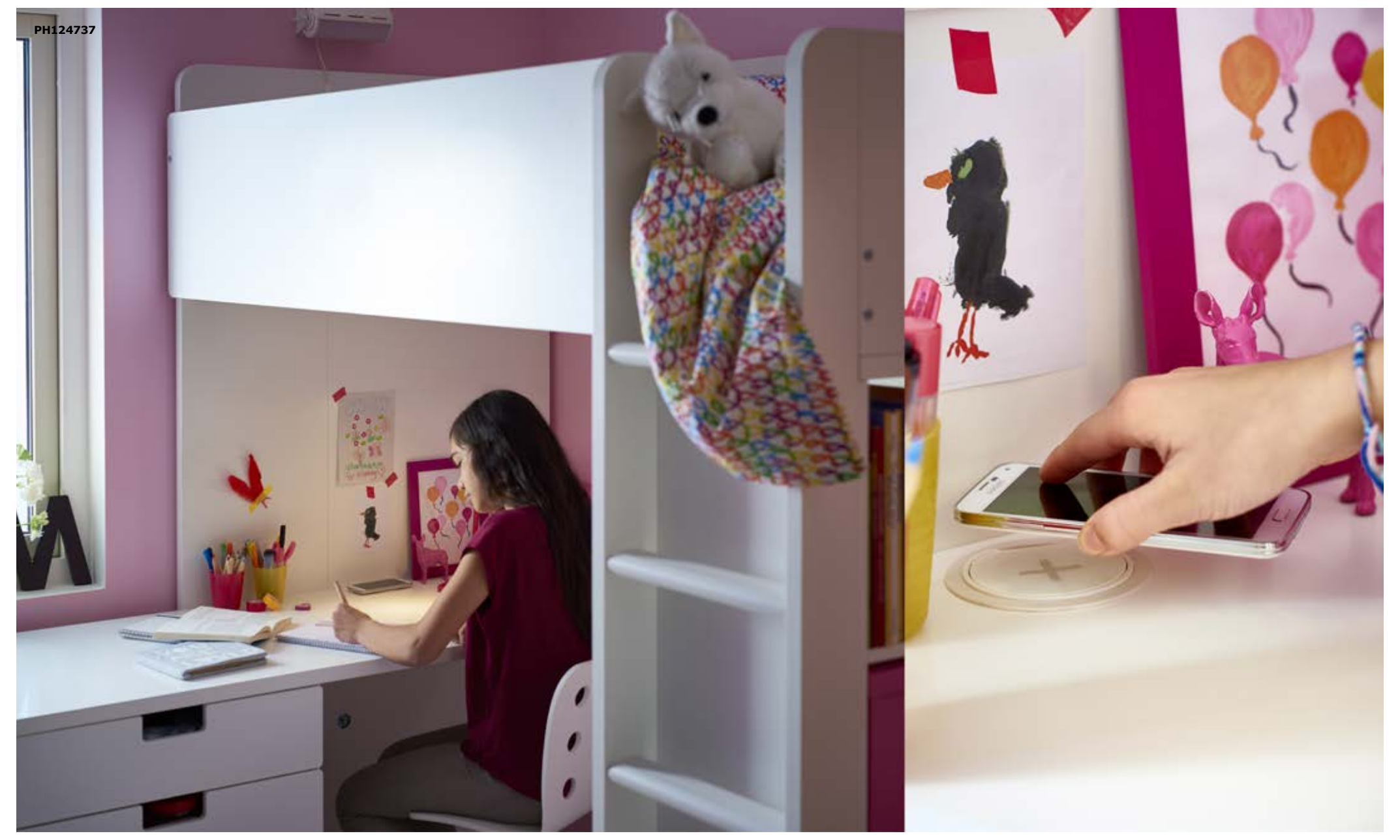
The STUVA loft bed combo can also be transformed into the biggest charger in the world, letting young ones charge their phones while figuring out the value of X.