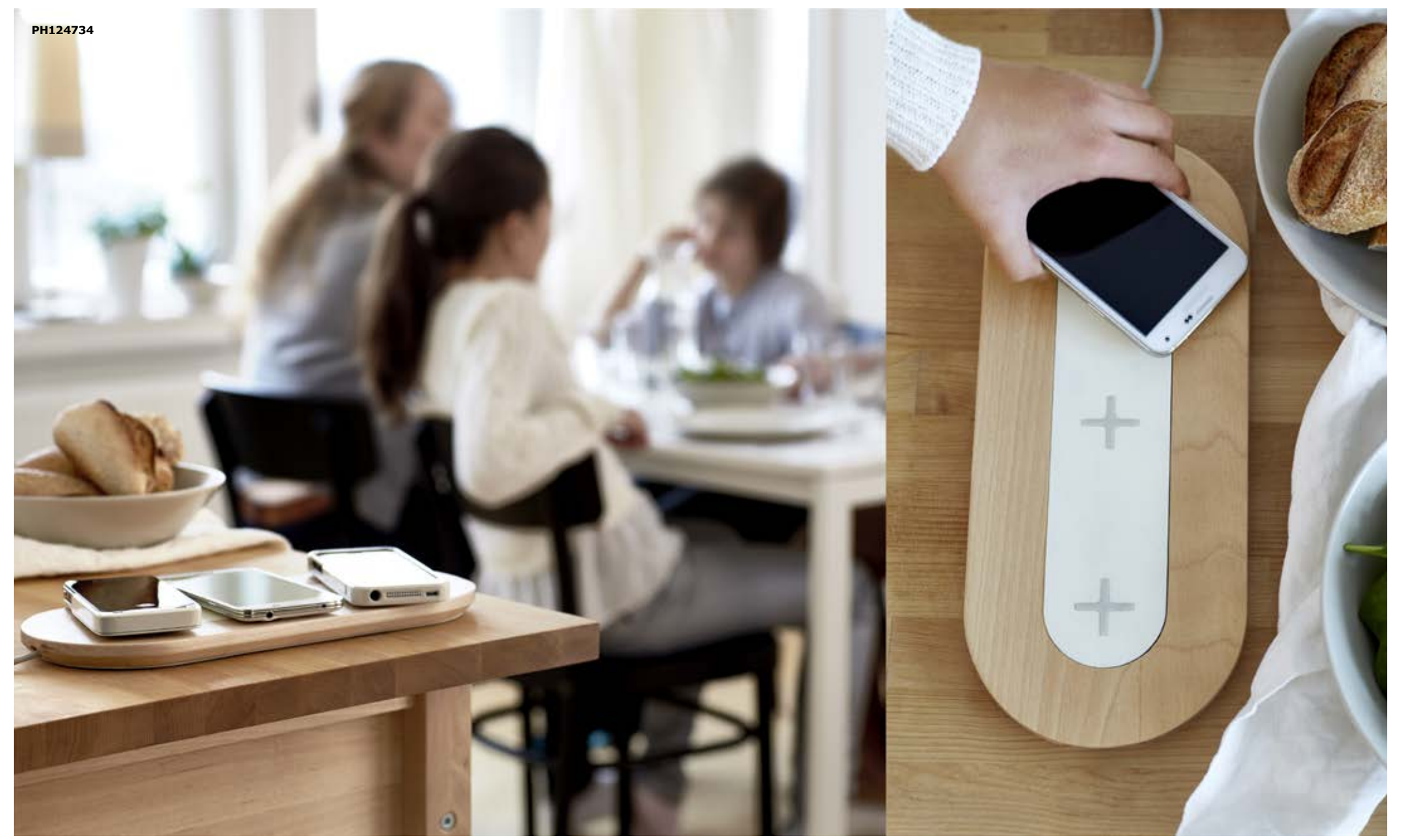
Checking friends' status updates can wait until after dinner. With NORDMÄRKE triple pad for wireless charging, you can charge your phone while negotiating who gets the last slice.