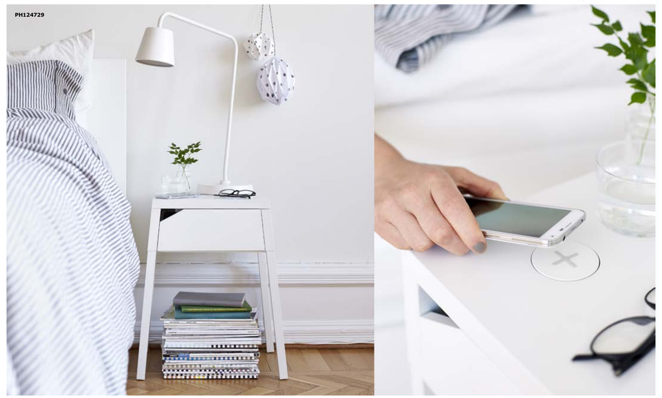
Charging your phone overnight is so easy with SELJE nightstand. No messy cords hanging from the table, and you won't need to worry about missing your wake up call because your battery ran out.