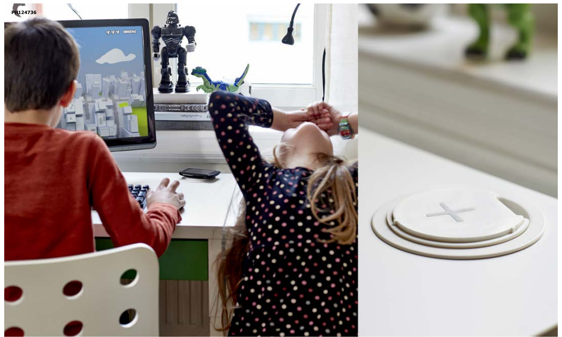
With a MICKE desk that doubles as a mobile charger, you can charge your phone while (impatiently!) waiting for your turn to play.